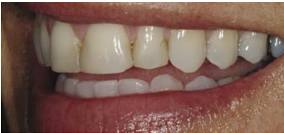
Figure 3: Pre-op smile