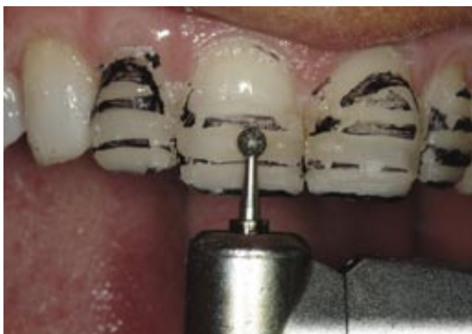
Figure 11: Use of depth cutting burs through Bis-acryl mock up