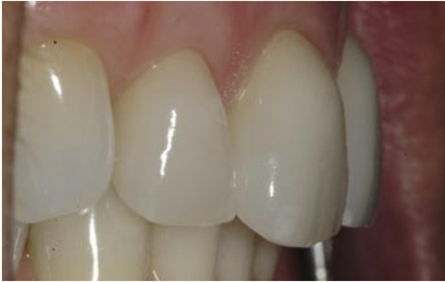
Figure 26: Final veneers bonded in place