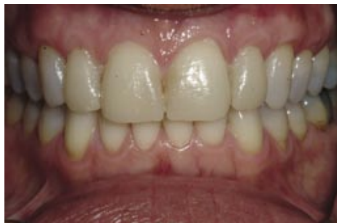
Figure 8: Bis-acryl mock up on teeth