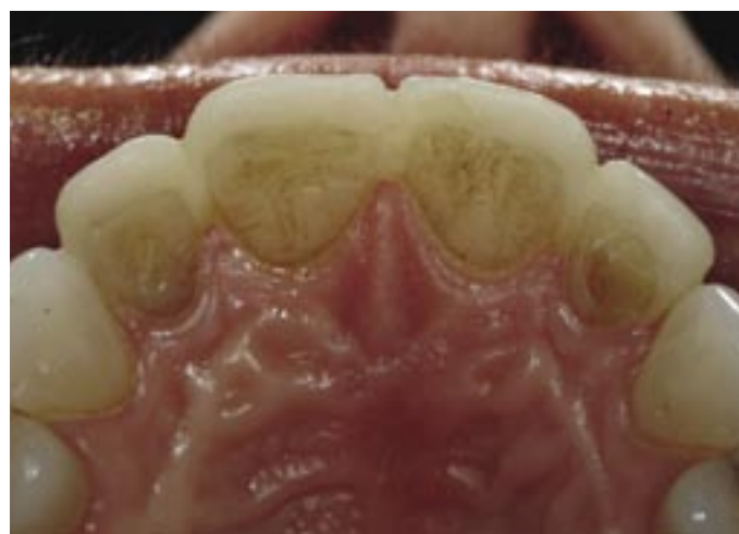
Figure 17: Temporary veneers mechanically locked in place after cementation with methylmethacrylate acrylic resin