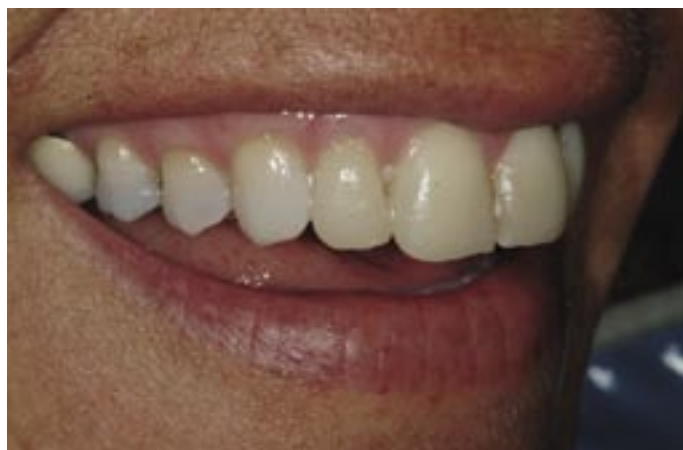
Figure 9: Bis-acryl mock up on teeth