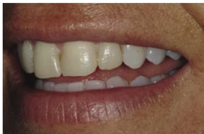
Figure 10: Bis-acryl mock up on teeth