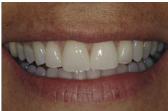
Figure 29: Post op appearance of smile