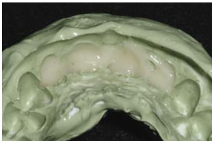
Figure 7: Bis-acryl resin in silicone matrix

2. The incisal edges of the central incisors were a similar length to those of the lateral incisors, creating a flat smile line. A more attractive appearance is obtained when the incisal edges of the central incisors are longer than those of the lateral incisors and the smile line