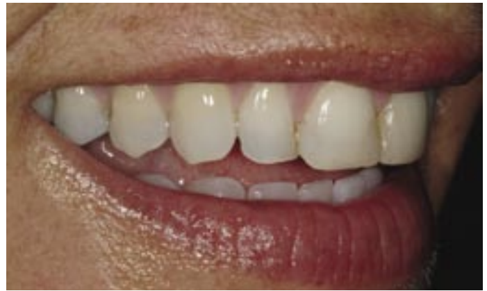
Figure 2: Pre-op smile