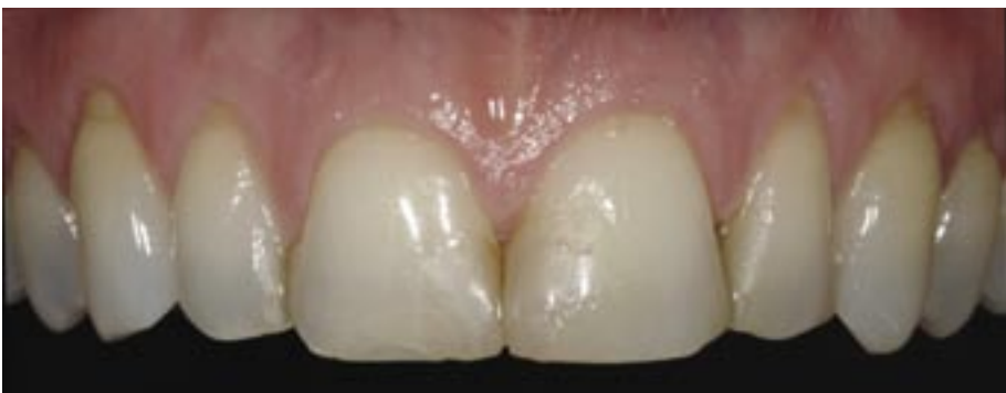
Figure 4: Gingival recession with exposed dentine. Note the large interproximal composite restorations on the four incisors