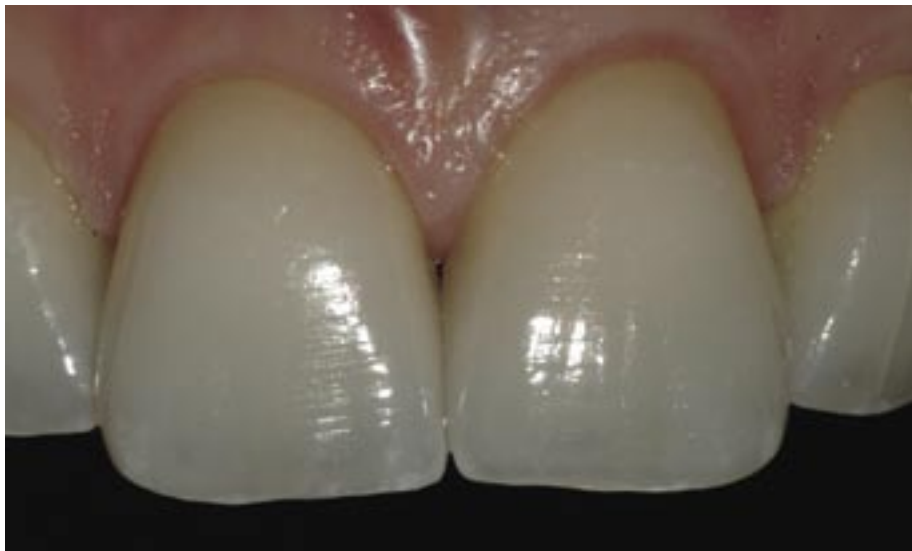
Figure 27: Final veneers bonded in place