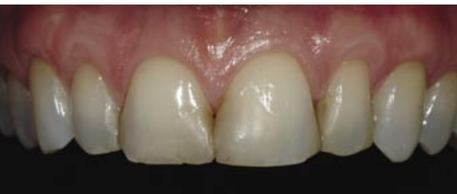
Figure 5: Post –periodontal surgery with root coverage (Dr Jonathan Lack)