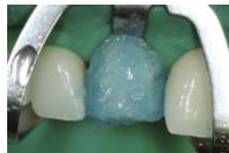
Figure 22: Phosphoric acid (36%) etching of enamel