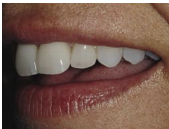
Figure 31: Post op appearance of smile.