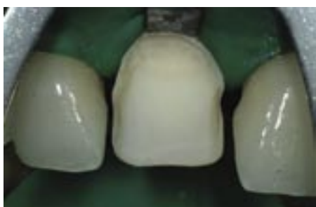
Figure 23: Clean frosty appearance of well etched enamel