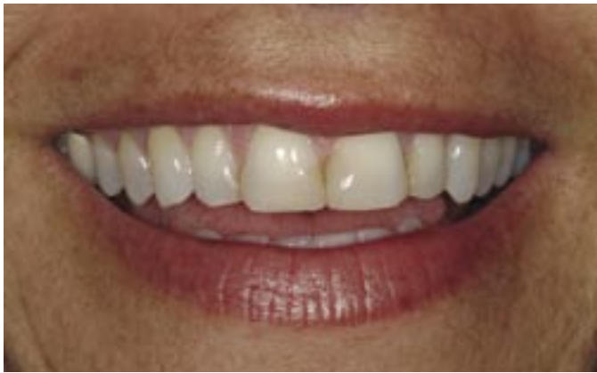
Figure 1: Pre-op smile