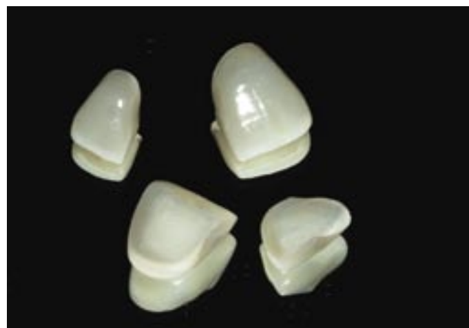
Figure 18: Final veneers. Note detailed, natural morphology, texture and characterisation