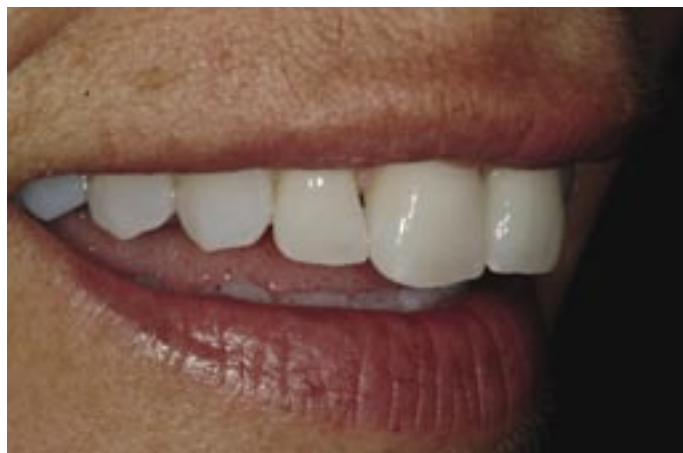
Figure 30: Post op appearance of smile