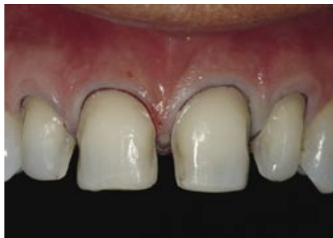
Figure 12: Final preparations with single retraction cord ready for final impression

forms an arc in harmony with the curvature of the lower lip (Sarver, 2001, Fradeani, 2004).