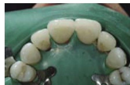
Figure 25: Palatal fit of porcelain veneers