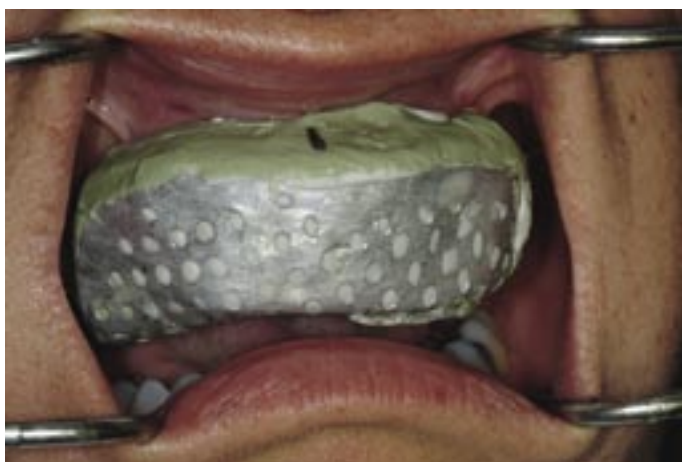
Figure 14: Silicone matrix in place for fabrication of temporary veneers from Bis-acryl resin