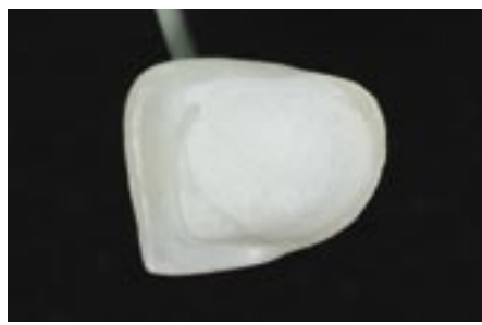
Figure 21: Clean frosty appearance of well etched porcelain