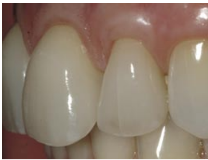
Figure 32: Post-bonding crack on left lateral incisor

is well bonded onto the underlying enamel a post bonding cracks does not jeopardise the longevity of the veneer and if the crack is not an aesthetic concern, the veneer should be left in place (Barghi and Berry, 1997). If the crack is obvious and detracts from the appearance, it is then necessary to remove and remake the veneer.