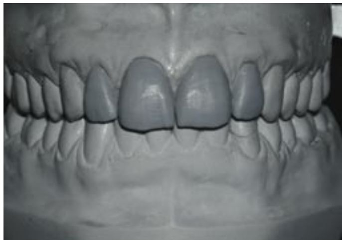
Figures 6a and b Original study casts compared to diagnostic wax-up