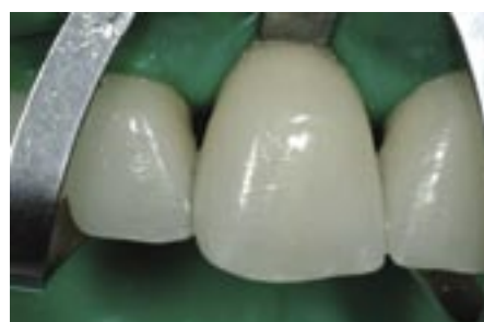
Figure 24: Bonded veneer in place. Note excellent visibility of margin due to rubber dam retraction.