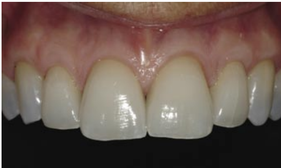
Figure 28: Final veneers bonded in place

surface and may reduce bond strength by 50%. To remove this debris, the veneers were rinsed with water for 20 seconds, then cleaned with 37% Phosphoric acid (gentle brushing with microbrush for a minute), re-rinsed with water for 20 seconds and then finally immersed in 95% alcohol in ultrasonic bath for five minutes. Following this protocol the veneer surface should appear clean and have a similar appearance to etched enamel (Figure 21). Silane coupling agent is then applied and if possible, dried well with warm air (Filho, 2004, Barghi, 2000, Shen et al, 2004).