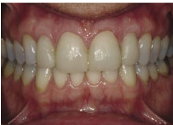
Figure 16: Temporary veneers cemented into place.