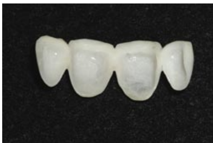
Figure 15: Bis-acryl temporaries with margins refined/relined with methylmethacrylate acrylic resin.