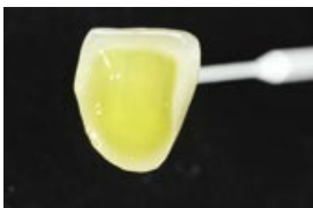
Figure 20: Hydrofluoric acid (9%) etching internal surface of veneer

The internal surface of the porcelain veneers were etched for 90 seconds with 9% Hydrofluoric Acid (Figure 20). Hydrofluoric etching generates a significant amount of crystalline debris that contaminates the porcelain